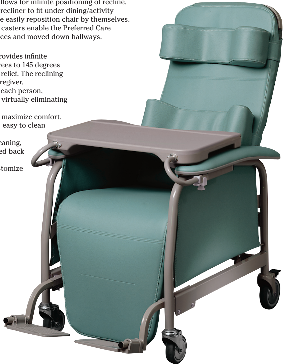
Tray Table and bolsters sold separately and are not included with recliner.